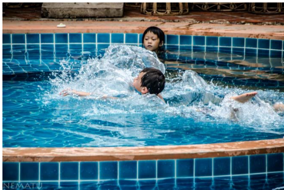
Jaccuzzi from the big pool.