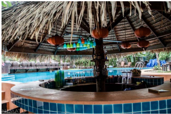
Bar of the big pool. Six seats in the water.