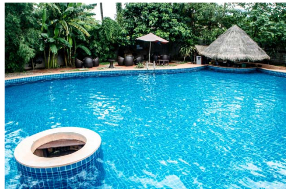
Big pool, view of the pool bar.