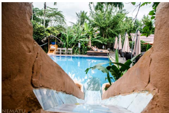
Slide in the small pool.

House in the background, the new owner can live in this house.