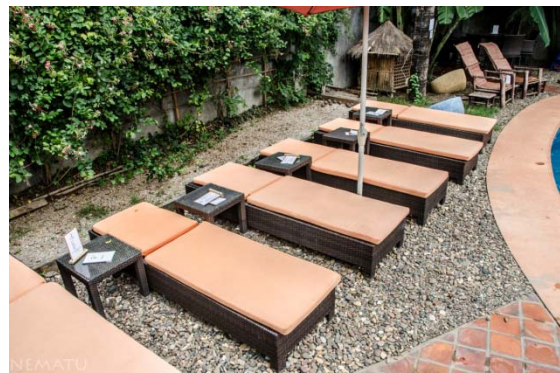
Lounges chairs near the big pool.