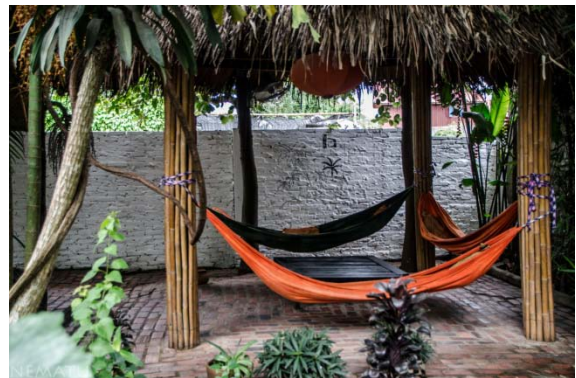
Rest area with hamacs

House in the background, the new owner can live in this house.