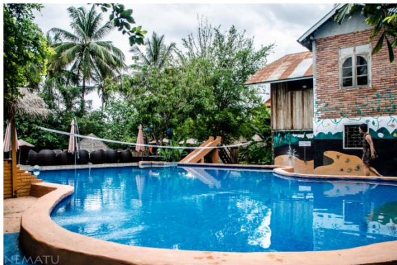
Small swimming pool, can play volley ball

For more informations, call Nathalie 020-5966-1204 or outside Laos: 856-20-5966-1204 or email: quitoyyo@hotmail.com